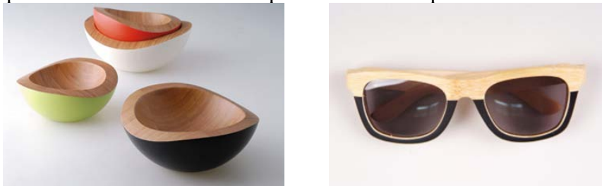
Figure 3: Bamboo products produced by pressing technology and eyes of bamboo eyelids

The traditional bamboo products adopt traditional hand-made technology, the production efficiency is relatively low, and the traditional manual processing techniques are relatively backward, and the bamboo structure cannot be made a big breakthrough. If modern production technology is applied in the production process of bamboo products, the bamboo can be quickly cut and processed, and the rapid prototyping of the product can effectively improve the production efficiency of the product and realize the mass production of the product.