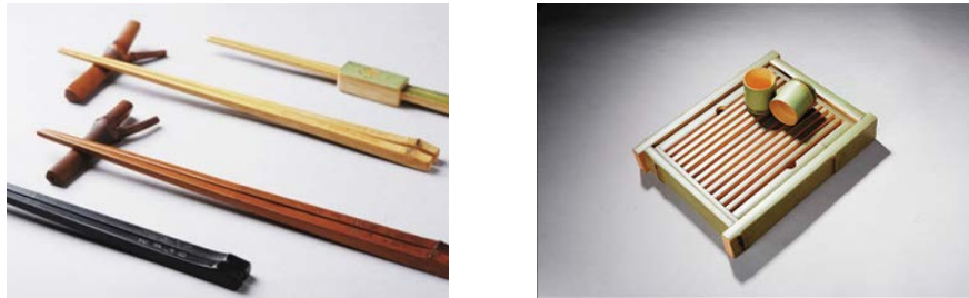
Figure 2: Bamboo products designed by Bamboo Art

In ancient China, bamboo products were applied to clothing, food, housing, travel, and musical instruments. However, the development of society and economy was backward. Bamboo products at that time could meet the needs of people's material and spiritual life. For example, you can punch the flute and Xiao on the bamboo and the sound is very pleasant. However, with the progress of society, the human lifestyle has undergone earth-shaking changes, and the diversity of life has changed. The functions of traditional bamboo products can no longer meet the needs of modern people. Therefore, when designing bamboo products, we should study the material needs and spiritual needs of modern people based on the needs of human life, develop bamboo products that meet the functions of modern people, form different types of bamboo products, and improve bamboo products. For example, under the premise of retaining the characteristics of bamboo, the bamboo spirit's spiritual connotation and use function can be fully utilized to develop household items with useful value.