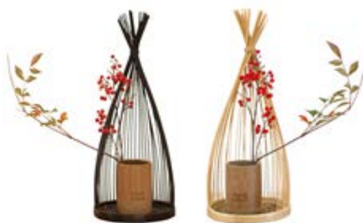
Figure 1: Bamboo products designed by Nature House

Nowadays, the style of bamboo products can no longer meet the aesthetic concept of modern people. Therefore, based on the preservation of traditional handicrafts, combined with the design concept of modern people, the style of bamboo products is innovative. When designing bamboo products, you can add the current fashion styling techniques, such as adjusting the overall proportion of the product, changing the gap between the bamboo pieces and the details of the bamboo joints to reflect the rhythm and rhythm of modern atmosphere.